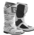
GAERNE SG-12 MX BOOTS

Lightweight alloy buckles Grip Guard Dual Composite Sole (anti-shock rubber) Front plate/shin guard Adjustable calf area Dual stage pivot system € 519,-