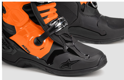
LOW PROFILE TOE BOX GREATER FEELING OF CONTROLS