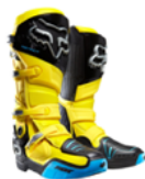
FOX INSTINCT LE MX BOOTS

Hinge Lockout: Stops motion before hyper extension Duratac: Exclusive Fox rubber compound for grip Slim medial design Low Ride Chassis Instinct Buckle: Flawless operation Slim Toe Box: Easy Shifting € 499,90