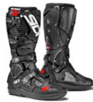
SIDI CROSSFIRE 3 SRS BOOTS

Replaceable Shin Plate Exclusive and patented flex system Stitch-free and replaceable boot leg Toe area covered with plastic reinforcement Rigid, shock resistant, anatomically shaped heel cup Fully adjustable calf area Micro adjustable, replaceable buckle system € 509,-