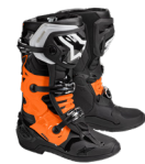
KTM TECH 10 BOOTS

Streamlined design Reduced volume and weight Lightweight microfiber, and impact and abrasion resistant TPU shell Anatomical shin and calf-plates Patented Frontal Flexion Control Frame Asymmetrical Dual-pivot Arms Patented Dynamic Heel Compression Shock Absorber Cold-forged aluminium buckles Unique sole integration Two grip zones on the inner side Lightweight, low profile sole € 579,-