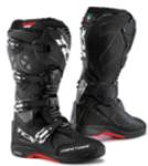
TCX COMP EVO MICHELIN MX BOOTS

Double Flex Control System Michelin Hybrid MX Sole 4 aluminium buckles, micro-adjustable and interchangeable PU adjustable shin plate PU bootleg + soft padding at ankle area; € 479,-