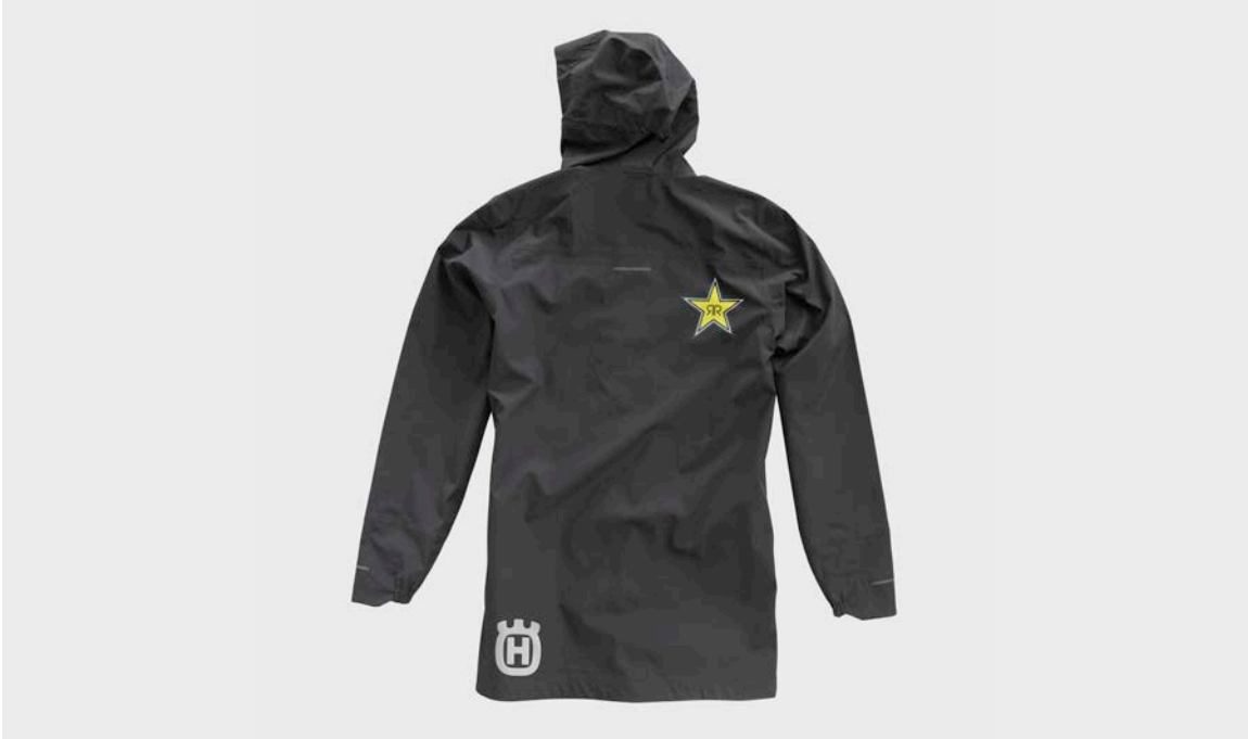
3RS21001330X / RS Remote Parka