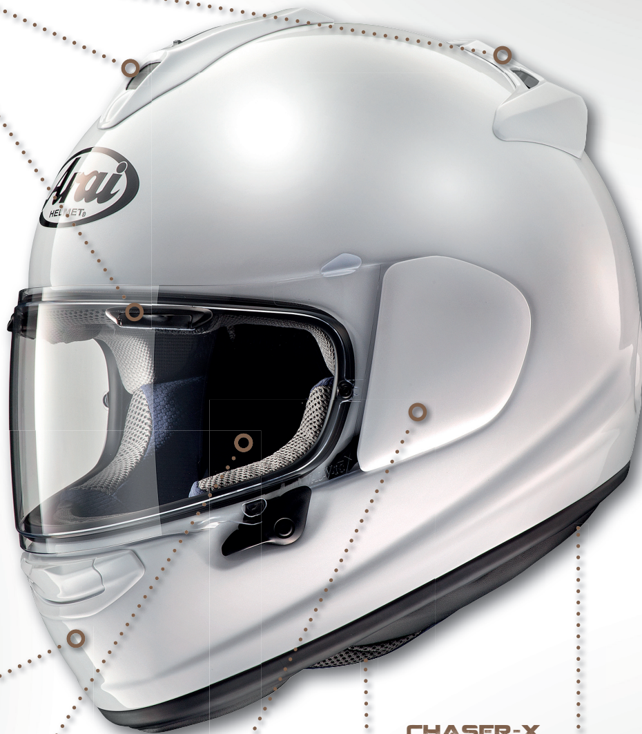
CHASER-X Diamond White

** Innovated and exclusively offered by Arai